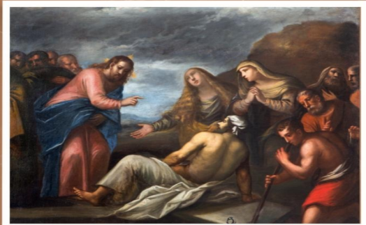
Memorial of Martha, Mary, and Lazarus